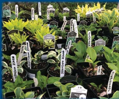
The hostas were in their bright green glory at the 2019 Hosta Walk.