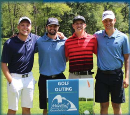
Team "Mosquito Squad" won first place at the 2019 Golf Outing