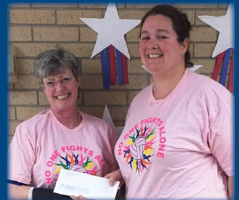
New Lisbon High School's volleyball team raised funds to support 3D mammography