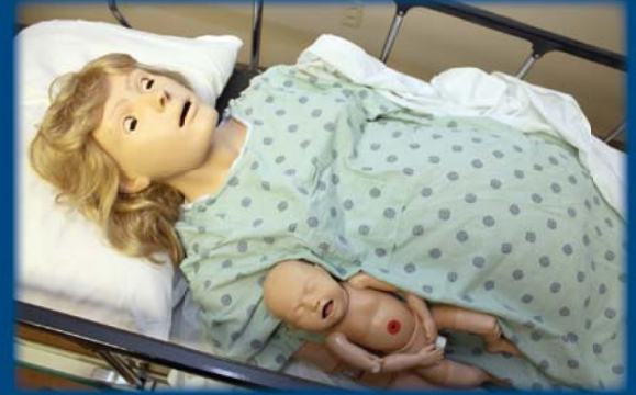
Nolle, the OB Simulator, and her babies have been great additions to the Obstetrics team. The little family has been helping nurses, EMTs, medical staff and other team members train for emergency situations during childbirth.