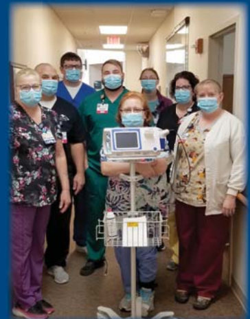
Health Promotions treadmill (left) & Crest View bladder scanner (right)